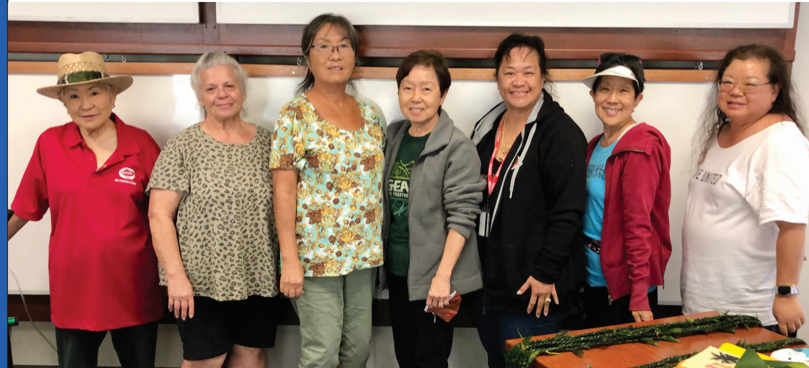
Ti Leaf lei making January 29 at WHi Civic Center